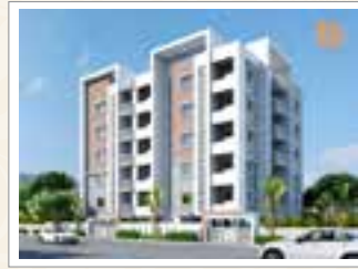
JUBILEE ASHIRVAD @ Nakkala Gutta, Hanamkonda