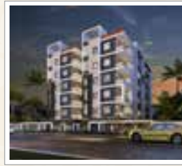
JUBILEE LANDMARK @ Srinagar Colony, Hanamkonda