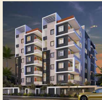
Jubilee Landmark Srinagar Colony, Hanamkonda