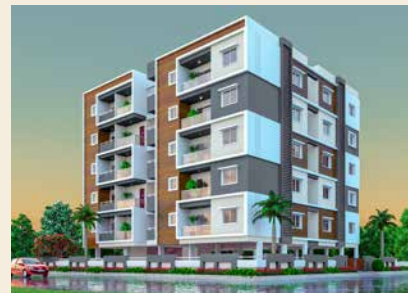
Jubilee Venkata Krishna Nilayam Kishanpura, Hanamkonda