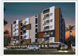
Jubilee Laxmi Nivas @ Lb Nagar.