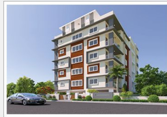
Jubilee Platina @ Kothapet